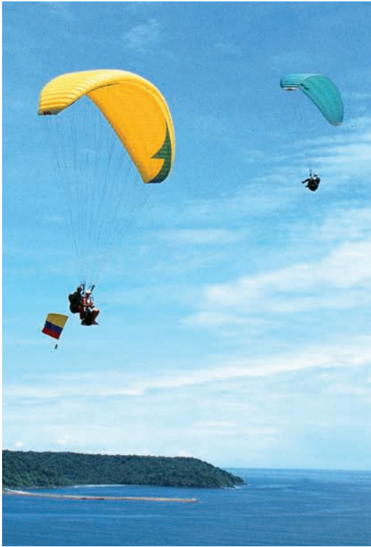
Pilots soar hundreds of feet above the ground, aided by wind currents and thermal pockets.